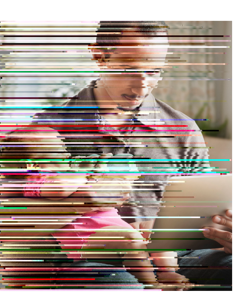
et confidentiel pour vous aider